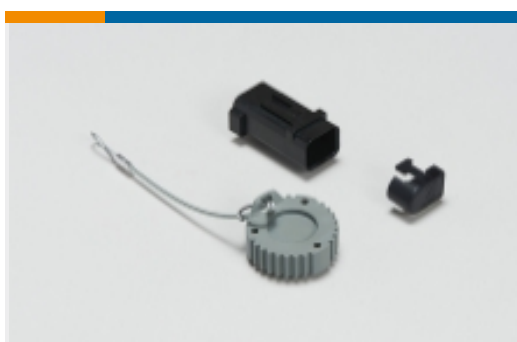
Automotive Connector Caps & Covers (5)