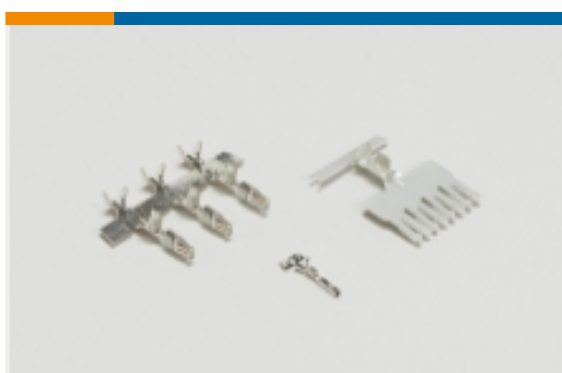
Busbars & Terminals(1)