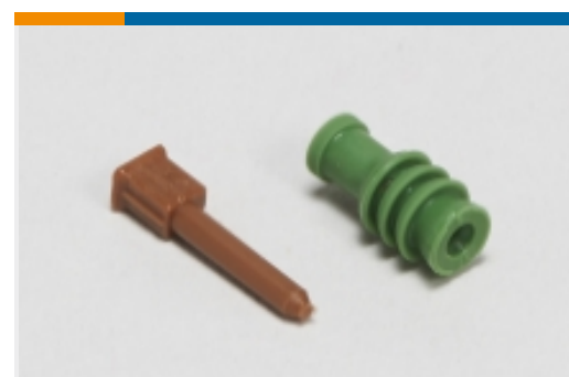
Automotive Seals & Cavity Plugs(10)